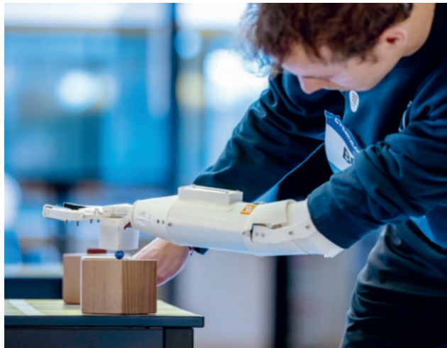
CYBATHLON aims to promote equality for people with disabilities at all levels.