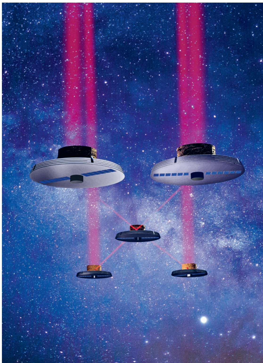
Impression of the Life space telescope, which is intended to detect and analyse infrared light emitted from the atmospheres of exoplanets.

Sustainable food systems, artificial intelligence, and supporting students, researchers and entrepreneurs: your support helped us to make advances in numerous areas at ETH in 2022.